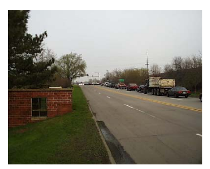
FIGURE 2. Four-lane Undivided Roadway/Intersection Operating as a "defacto" Three-Lane Cross Section

*ADT = Average daily traffic. NA = Not Available. Safety data duration is for before/after conversion. **Summarized results based on anecdotal information.