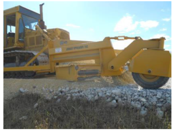
An aggregate spreader was used to place the macadam base and surface course materials