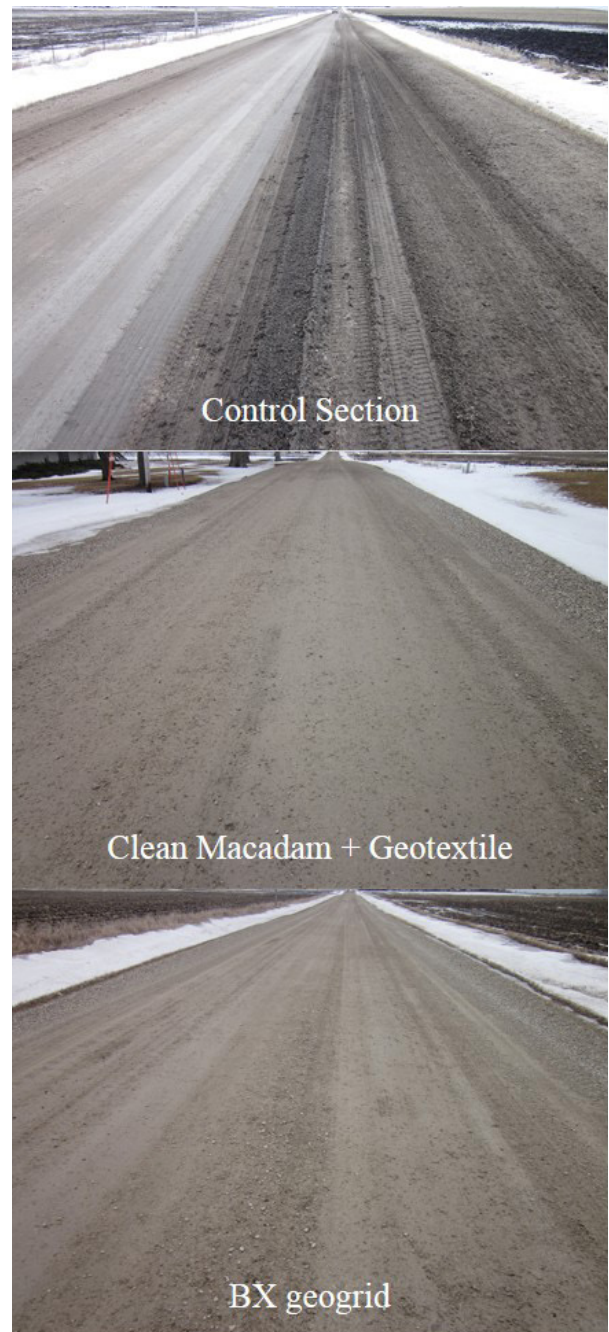
Post-thawing surface conditions of three demonstration sections (March 11, 2014)