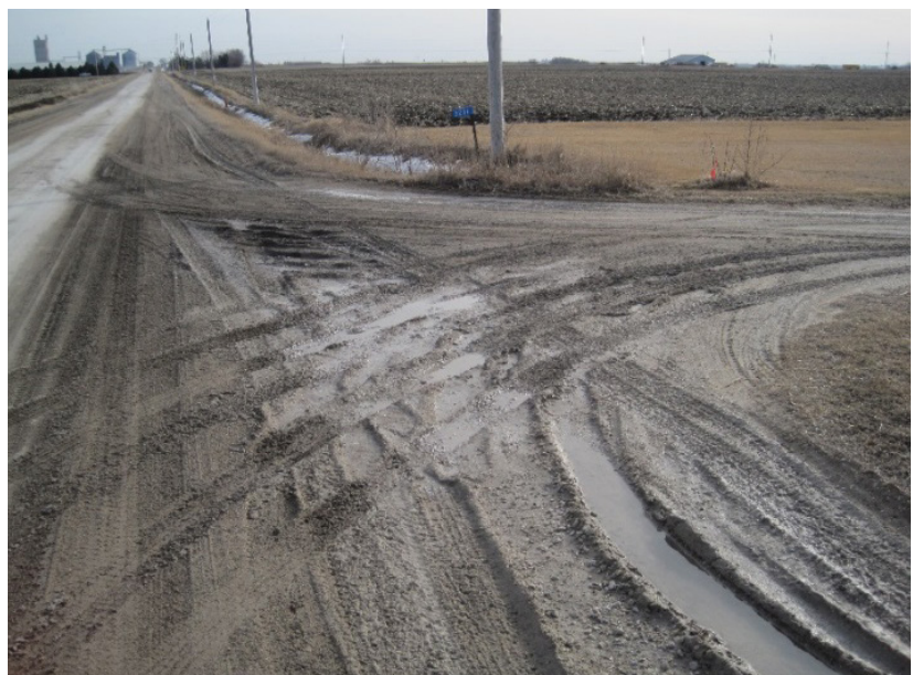
Post-thawing conditions of selected road before stabilization