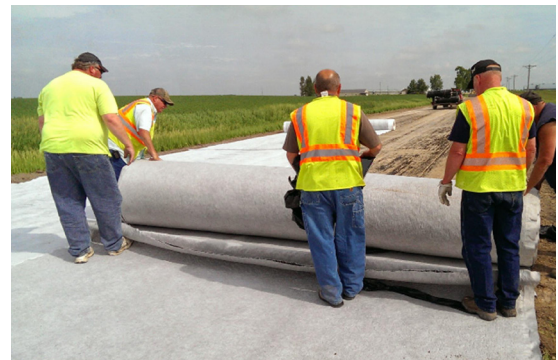
A geocomposite drainage layer was placed at the aggregate-subgrade interface in Section 18

Left to right: Dirty, clean, and recycled Portland cement concrete macadam materials