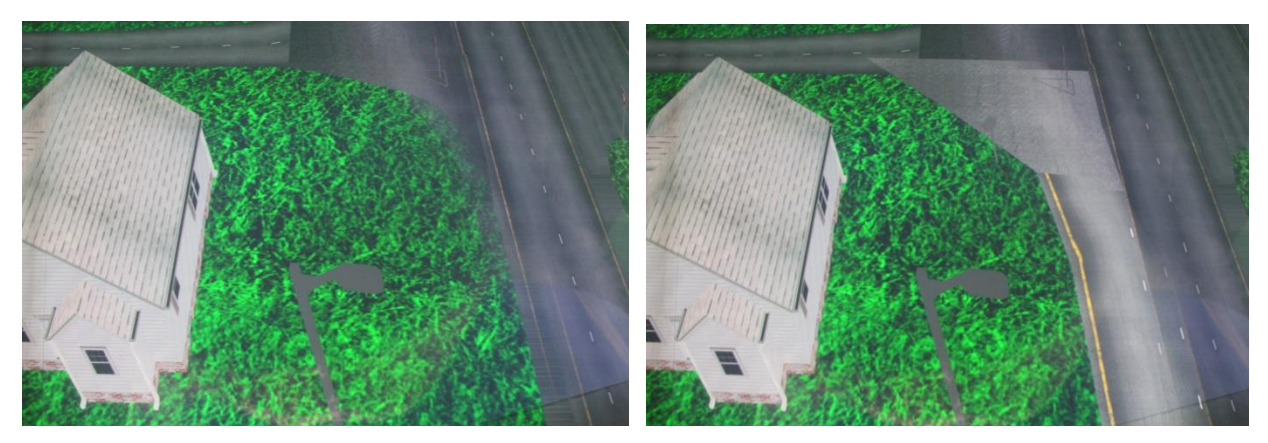
Figure 2. Simulator view of intersection with narrow merging lane (left) and a wide merging lane (right)

The image on the left presents one side of a road around a TWSC intersection on a flat terrain, while the image on the right presents the same road, but on a hilly terrain. Similarly, Figure 2 shows a bird's eye view of an intersection with a narrow and a wide merging lane.