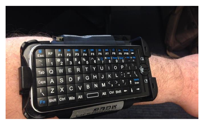
Figure 3. Arm-mounted wireless mini keyboard for dynamic simulation control

These and other terrain features can be modified real-time, in situ, through an arm-mounted wireless keyboard (see Figure 3).