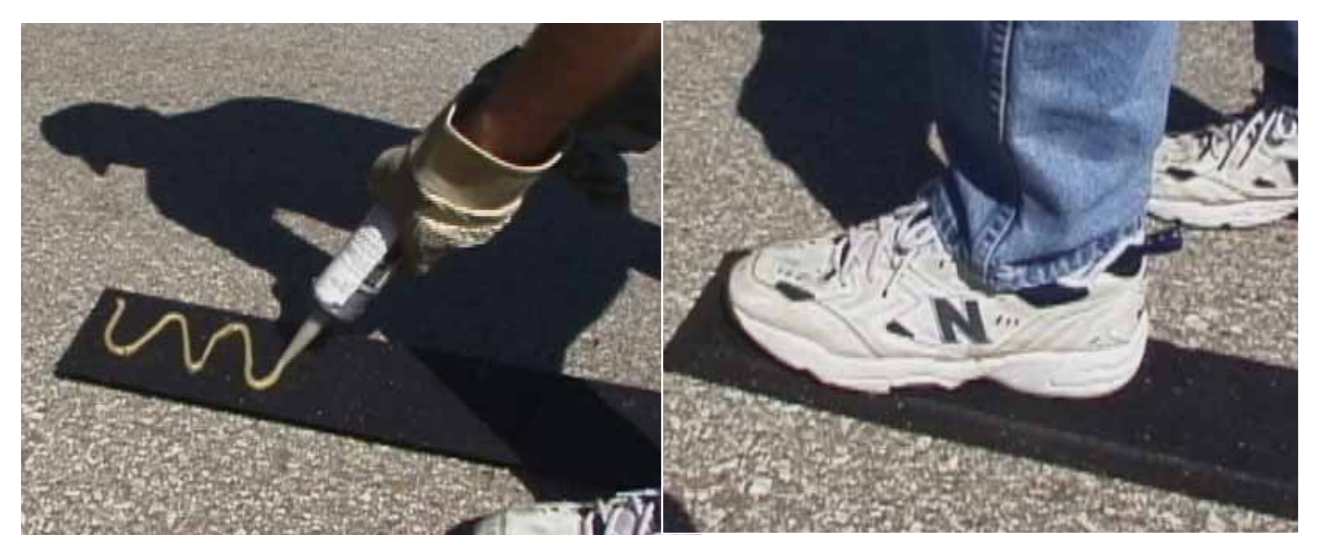
Figure 1. Applying urethane adhesive (left) and applying pressure to the strip (right).

pressure should be applied to the strip to help distribute the urethane and force it into the voids of the surface of the strip and that of the pavement. Figure 1 shows the urethane being applied to a rumble strip on the left. The right photo shows pressure being applied to the strip. The urethane must be allowed to set for 2 hours before loading.