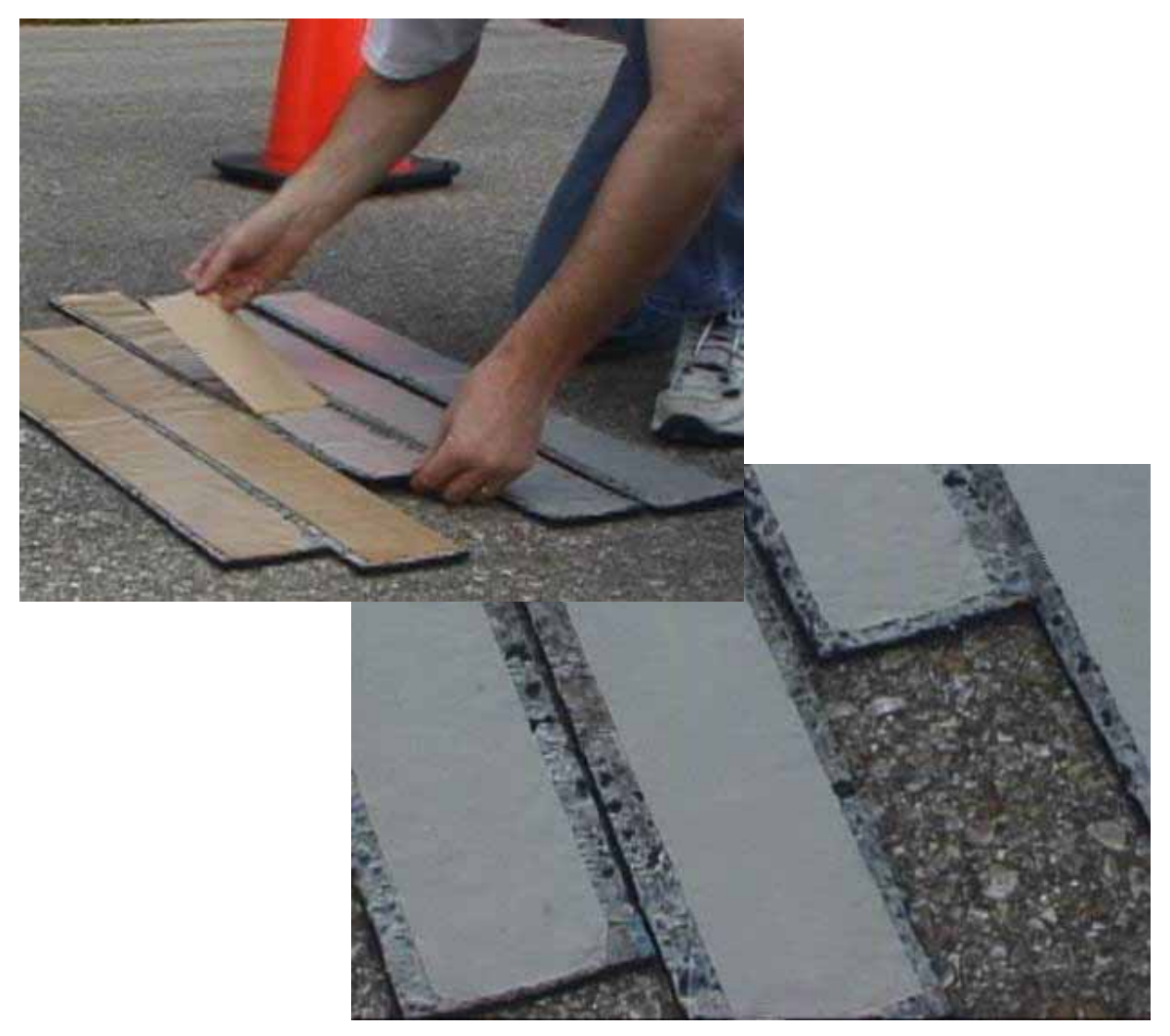
Figure 2. Applying replacement adhesive.

approximately 5/16 in. After the application of two additional layers of adhesive, the installed thickness was still measured as 5/16 in. The lack of change in the thickness may be because the changes was less than could be measured given the irregularity of the pavement, which served as the baseline. Another possibility is that the additional adhesive was forced into voids on the pavement surface by the force delivered by the tamper cart. Figure 2 shows the protective backing being removed from the replacement adhesive strips, and the strips after the backing was removed and before they were installed. The difference in width between the rumble strip and the replacement adhesive strip made the application of the adhesive to the rumble strip easier because perfect alignment was not necessary, as would be the case if they were the same width.