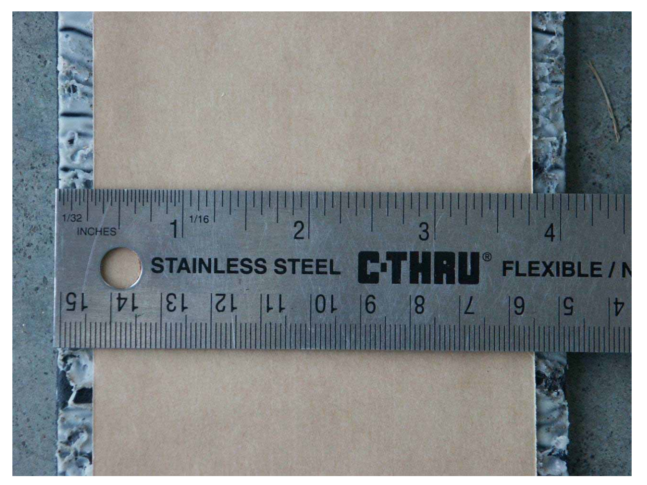
Figure 1. Reverse of the ATM rumble strip with replacement adhesive strip applied.