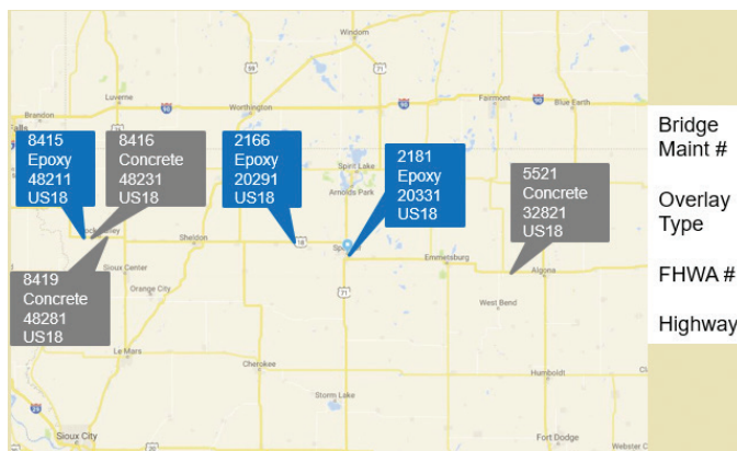
Locations of the six bridges investigated in this study

Six bridges in Iowa—three to be overlaid with LSDC and three to be overlaid with epoxy—were chosen to study the mechanical and durability properties of thin epoxy and LSDC overlays.