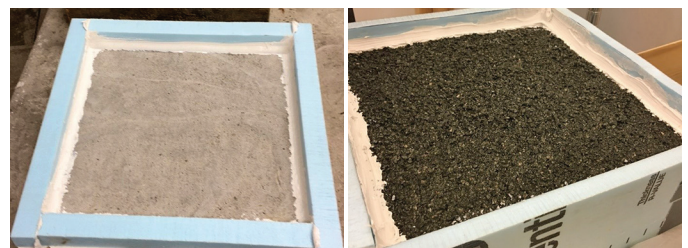
LSDC-overlaid (left) and epoxy-overlaid (right) slabs for laboratory testing

To determine the effect of freeze-thaw cycles on bond performance, the four remaining slabs were cut into 12 beams 3 in. wide, resulting in 6 beams for each overlay type. The beams were subjected to cyclic freeze-thaw conditions and tested using the direct pull-off strength test (ASTM C1583) at 0, 100, and 300 freezing-thawing cycles.