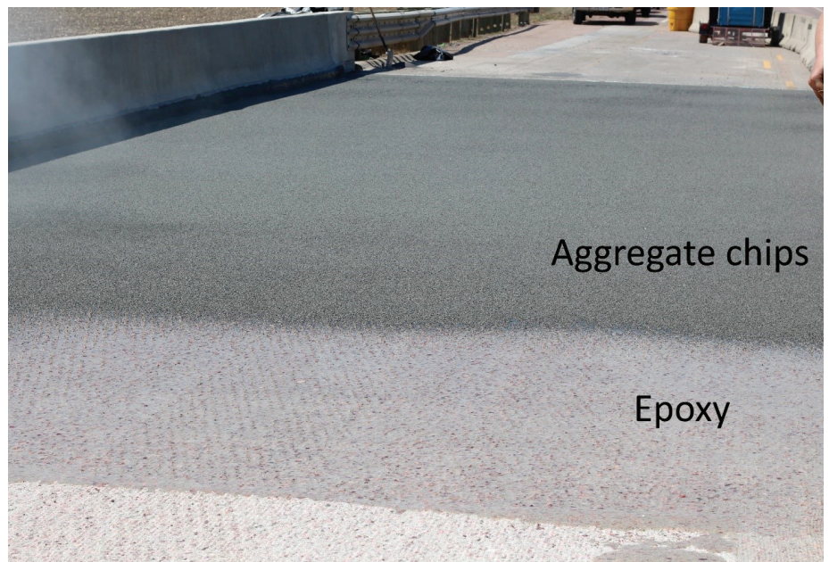
Thin epoxy overlay being applied to a bridge deck