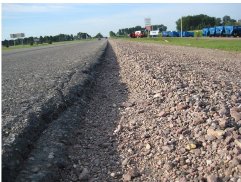
Edge rutting on granular shoulder (Jahren et al. 2011)

Evidence indicates that this strategy has the potential to reduce the number of required maintenance cycles on high-speed high-traffic roads (such as US Highway 20 near Jessup, Iowa with 9,000 vehicles per day/vpd annual average daily traffic/AADT and a speed limit of 65 mph) and last up to five years on moderate-speed medium-traffic roads (such as US 18 near Garner, Iowa with 6,000 AADT and a speed limit of 45 mph).