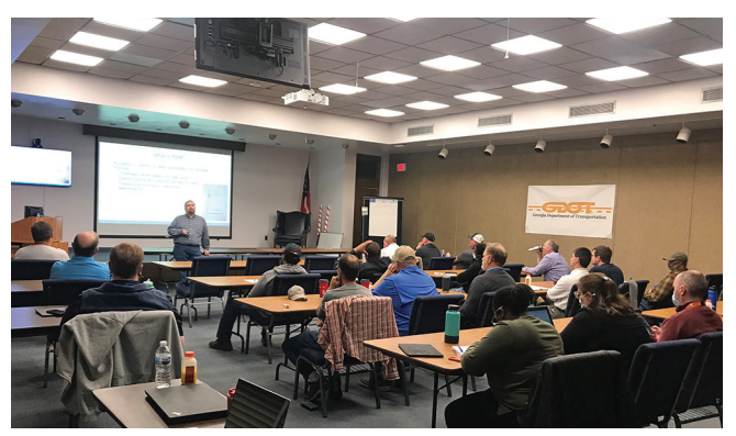
Figure 2. PEM workshop at the Georgia Department of Transportation (DOT)

The pooled fund member states were contacted by the research team in 2019 to gain an understanding of their current pavement specifications relating to PEM. A table was developed on how their specifications addressed the six PEM properties: strength, transport, shrinkage, freeze-thaw resistance, aggregate stability, and workability. This table is available at this link: https://intrans.iastate.edu/app/uploads/sites/7/2020/07/PEM-State-Spec_Reviews-Table-2020-07-02.pdf