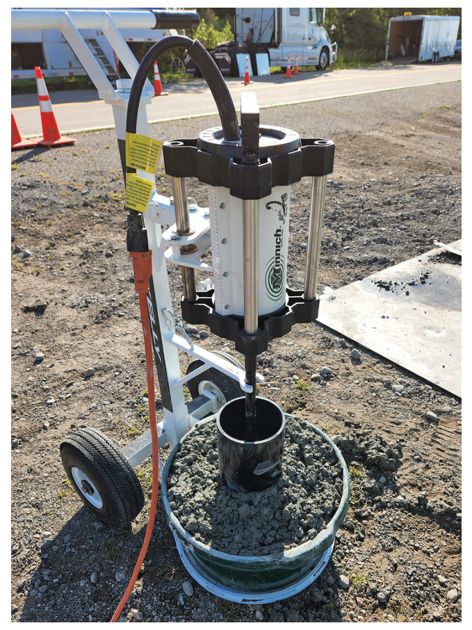
Feedback from some of the states that were provided with VKelly devices was that the system was labor intensive and not user friendly, although in some cases it was felt that the data were valuable. It was reported that a number of operators were using a variety of vibrators and head sizes leading to large variability in the data produced.

The purpose of the VKelly test is to indicate how a mixture will respond to vibration, providing more information than the yield stress reported by the slump test. Figure 6 shows the VKelly during field testing.