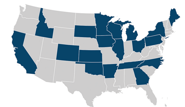
Figure 1. PEM pooled fund member states

The FHWA, 19 state transportation agencies, 7 state paving chapters (in Minnesota, Pennsylvania, Michigan, Wisconsin, Iowa, Oklahoma, and the Southeast region), and 4 national associations (Portland Cement Association, American Concrete Pavement Association, Slag Cement Association, and RMC Research & Education Foundation [now Concrete Advancement Foundation]) came together to fund this project. This coalition of federal, state, and industry leaders was dedicated to maximizing pavement performance. Figure 1 shows the locations of the 19 pooled fund member states.