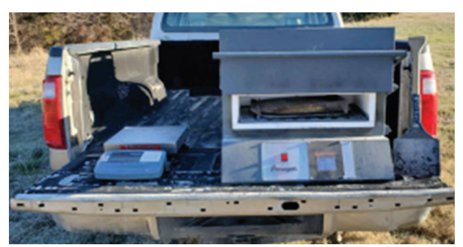
Figure 5. Phoenix testing device

Under this project, the research team at Oklahoma State University worked with the Minnesota DOT (MnDOT) and the FHWA Mobile Concrete Lab to use the Phoenix device in the field and gather feedback. Figure 5 shows the Phoenix device during field testing.